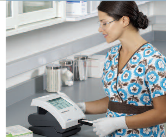
Automated hCG pregnancy testing

Siemens leads the way in urinalysis testing with world-class service