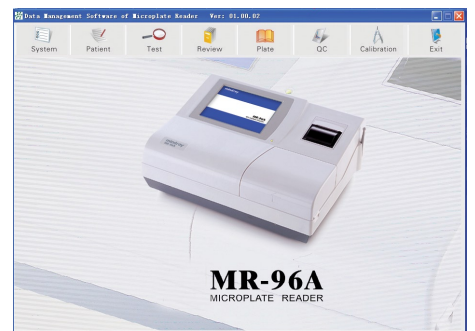
Data Management Software