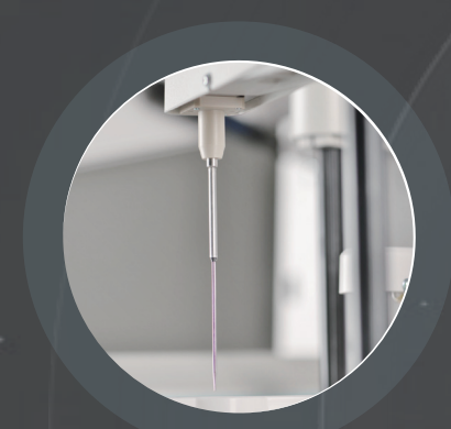
Fully automated maintenance