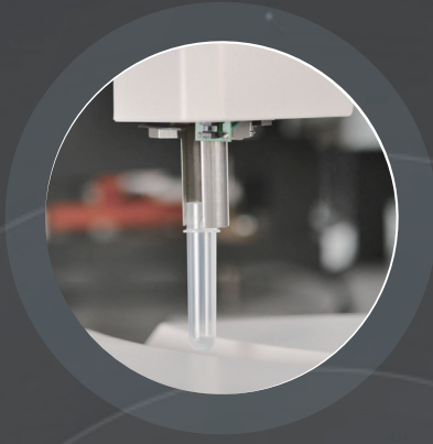
Liquid-solid waste separation More environmental friendly