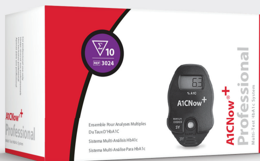
A1CNow ® + system (10-count test kit) 3024

Informed conversations at the point of care